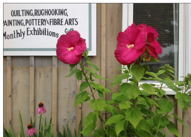
The garden outside the Pottery Studio.