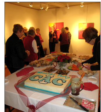
Members 40th Anniversary